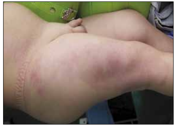
Fig. 6 and 7. Pat. No. 3. Burns treated with Cicatrix cream. Before and after the treatment Ryc. 6 i 7. Pacjent nr 3. Miejsce po oparzeniu leczone kremem Cicatrix. Stan przed i po terapii