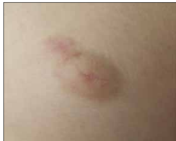
Fig. 4 and 5. Pat. No. 2. Scars treated with Cicatrix cream. Before and after the treatment Ryc. 4 i 5. Pacjent nr 2. Blizna leczona kremem Cicatrix. Stan przed i po terapii