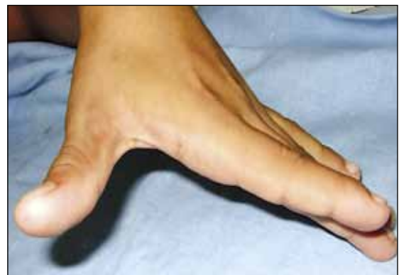
Fig. 10 and 11. Pat. No. 5. Burns treated with Cicatrix cream. Before and after the treatment Ryc. 10 i 11. Pacjent nr 5. Miejsce po oparzeniu leczone kremem Cicatrix. Stan przed i po terapii

Bad (unfavourable): was considered to be in cases where the changes in size or the colour were less than 25%, if the lesion had stayed the same or even got worse during the treatment.