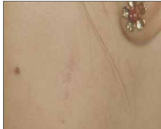
Fig. 2 and 3. Pat. No. 1. Scars treated with Cicatrix cream. Before and after the treatment Ryc. 2 i 3. Pacjent nr 1. Blizna leczona kremem Cicatrix. Stan przed i po terapii